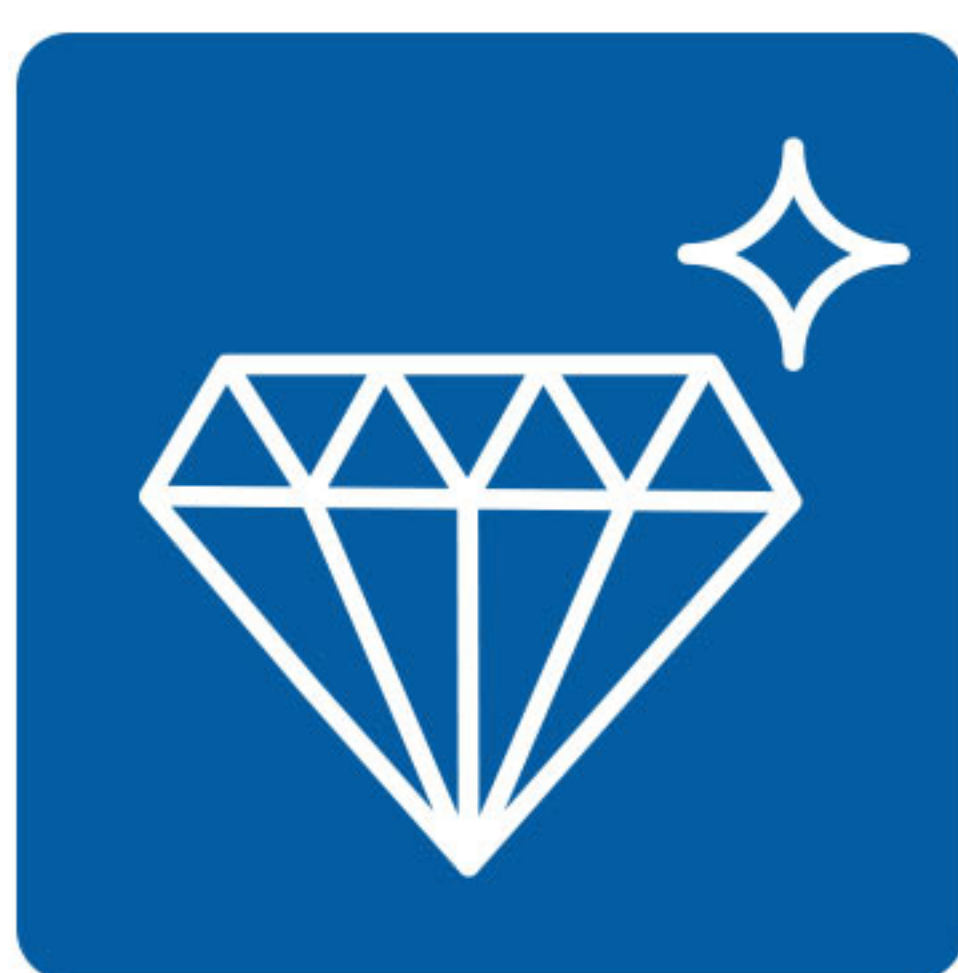
Strong & Durable